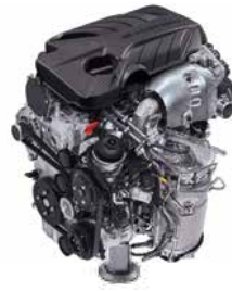
1.6 Diesel engine

1.5 GDI-Turbo engine with improved low-speed torque performance and superior start/overtaking acceleration in the maximum torque classification, for a more exciting driving experience. The eco-friendly 1.6 diesel engine delivers best-in-class performance under any driving conditions.