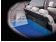
With magic tray removed