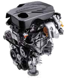
1.5 GDI-Turbo engine