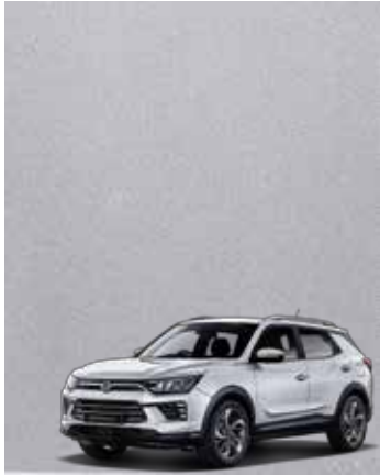
Grand White (WAA)