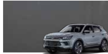
Platinum Gray (ADA)