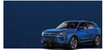
Dandy Blue (BAS)