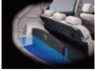
With magic tray

Whether you're following the daily routine or loading up for a weekend outing, the all-new Korando demonstrates an amazing ability to fulfill your needs. The two-level magic tray combines the strengths of a sedan and SUV to make life a lot easier.