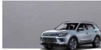
Silent Silver (SAI)