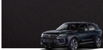
Space Black (LAK)