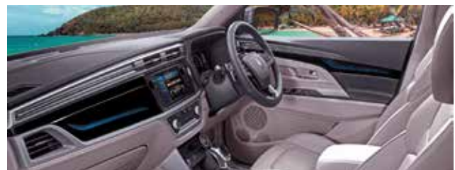
Spacious glove box

All-new Korando's spacious cabin is appointed with premium materials that pamper and isolate you from the hustle and bustle of the outside world. The all-new Korando ensures pure traveling delight.