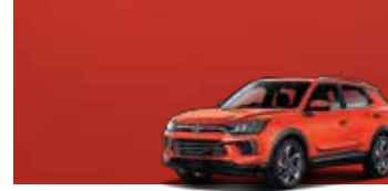
Orange Pop (RAT)