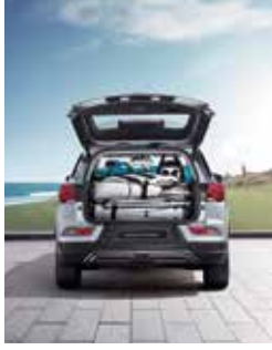
522L Luggage Space