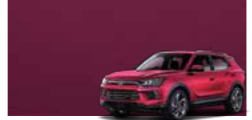
Cherry Red (RAV)